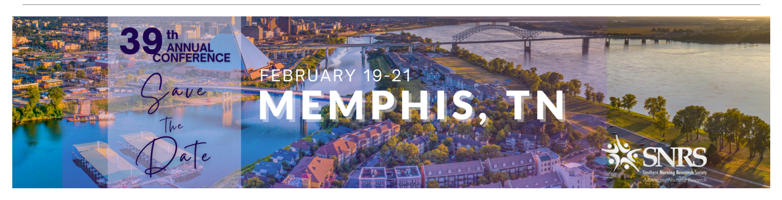
From Social Determinants to Precision Health Innovations: Nursing Research for Today and Tomorrow